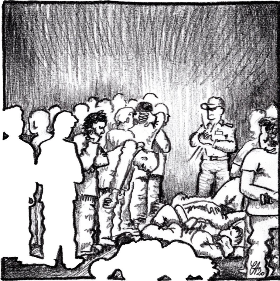
Prisoners sleeping on the floor.