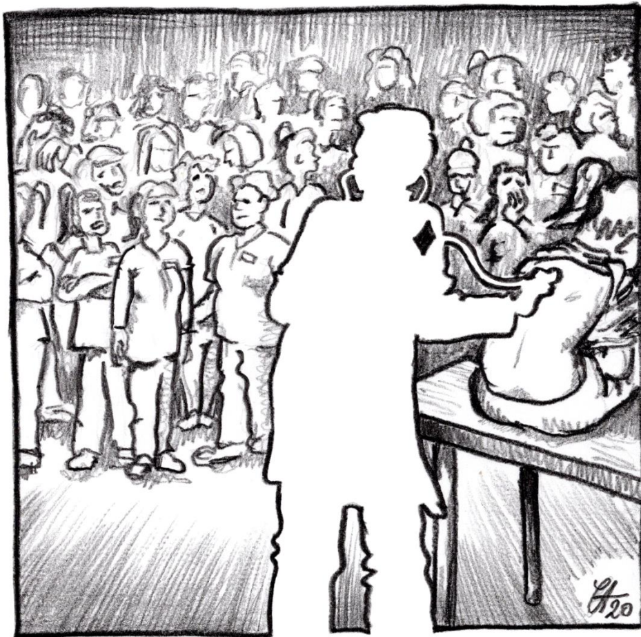
Lack of medical staff.