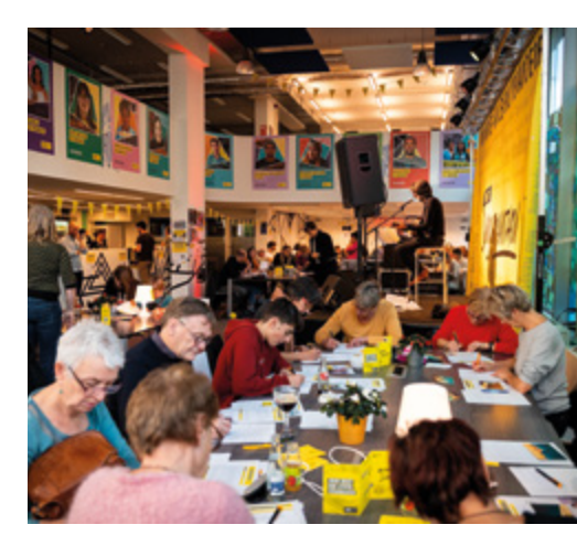
Letter writing event in Antwerp, Belgium, for Write for Rights 2022.

HAVE THE SPACE required for them to engage emotionally and develop their own attitudes.