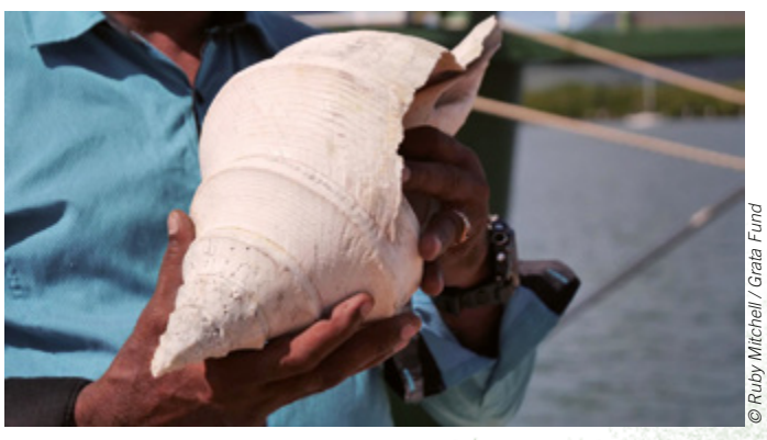
Top: Uncle Paul holding a traditional woven mat. Bottom: Uncle Pabai holding a bu shell, used for ceremonial purposes among Torres Strait Islanders.