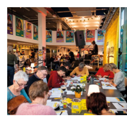
Letter writing event in Antwerp, Belgium, for Write for Rights 2022.

HAVE THE SPACE required for them to engage emotionally and develop their own attitudes.