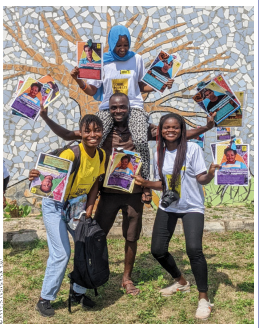
Launch of Write for Rights 2022 in Lomé, Togo

Human rights are not luxuries to be met only when practicalities allow.