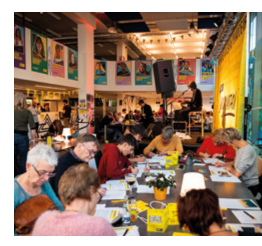
Letter writing event in Antwerp, Belgium, for Write for Rights 2022.

HAVE THE SPACE required for them to engage emotionally and develop their own attitudes.