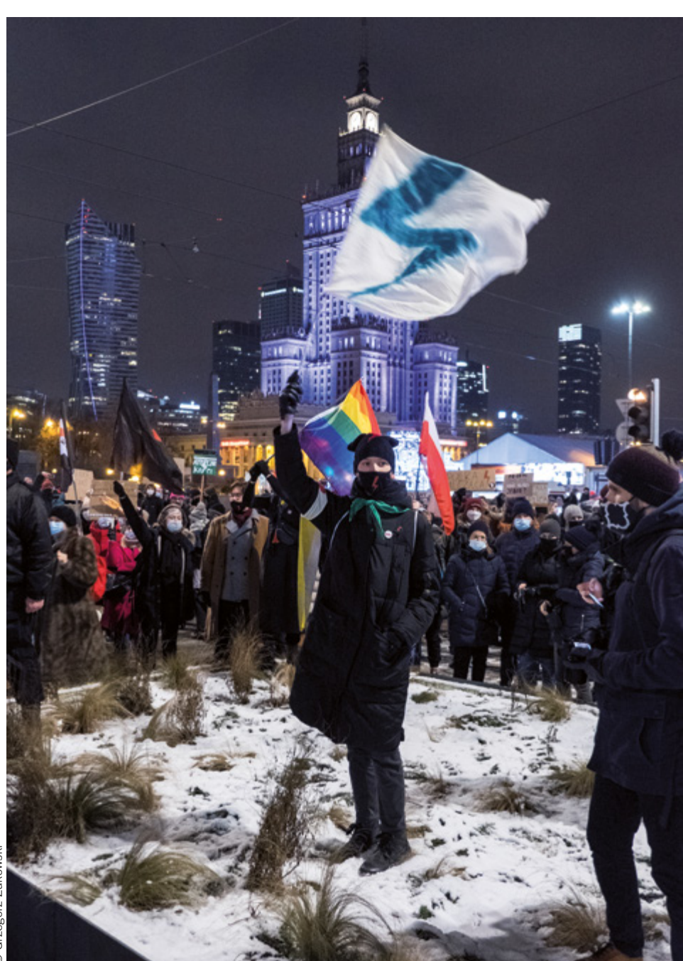
On 29 January 2021, thousands of people marched through the Polish capital Warsaw to mark 100 days of protest against the neartotal ban on abortion in Poland.

Show participants the video of Justyna which can be found here: www.amnesty. org/w4r-videos (available in English).