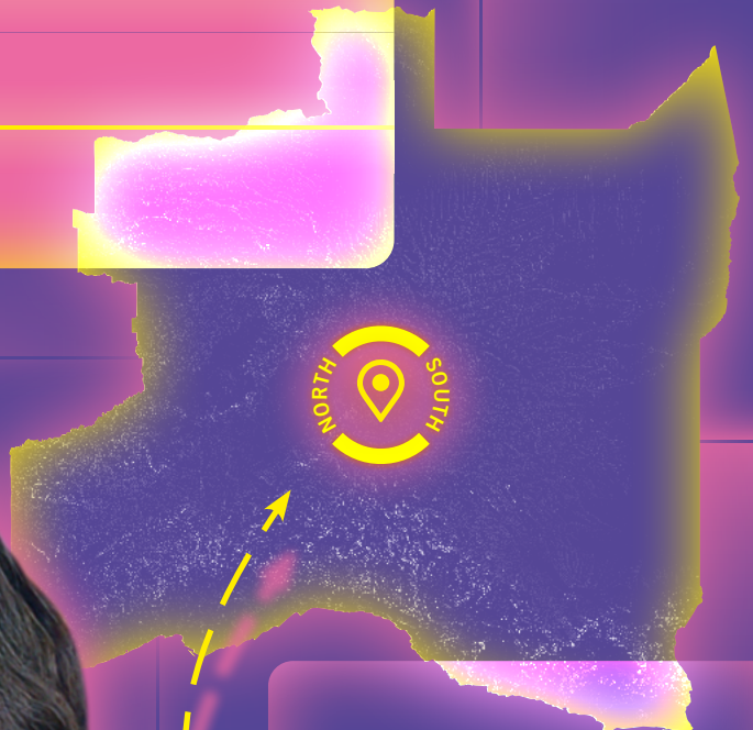
Neth Nahara, Angola