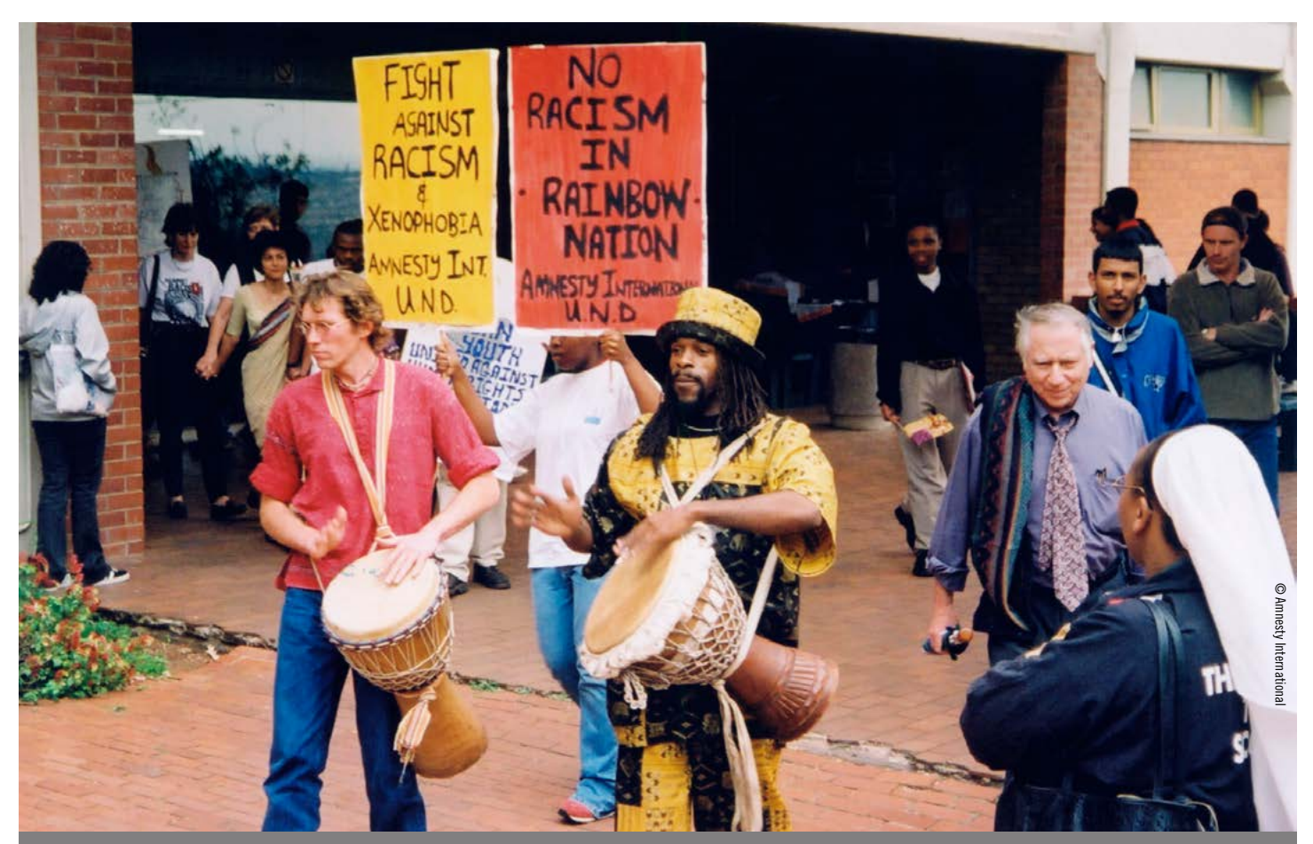
University of Natal Amnesty International Group in Durban, South Africa being led by drummers on an Anti-Racism Protest, during the World Conference Against Racism in 2001.

because of their colour, race, ethnicity, descent (including caste) or national origin. Research conducted by Amnesty International shows that members of ethnic minorities often suffer torture, ill-treatment and harassment at the hands of the police. In many parts of the world they face unfair trials and discriminatory sentencing which puts them at increased risk of harsh punishments, including the death penalty.