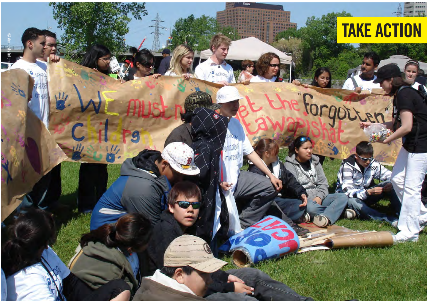
Amnesty International activists participate in the Aboriginal Day of Action on June 28, 2008 in Ottawa.

If you have been inspired to action by reading Seven Fallen Feathers , here are five ways you can make a difference.