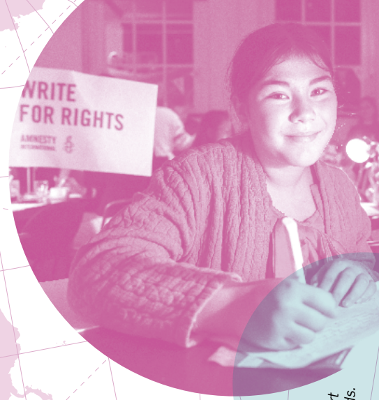
Amnesty supporters and members take part in Write for Rights 2024 in the Netherlands.

AMNESTY INTERNATIONAL IS A GLOBAL MOVEMENT FOR HUMAN RIGHTS. WHEN INJUSTICE HAPPENS TO ONE PERSON, IT MATTERS TO US ALL.