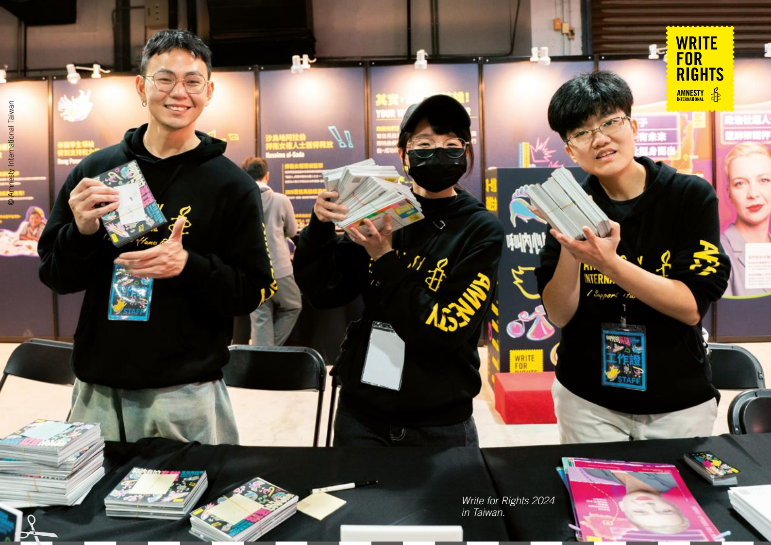
Write for Rights 2024 in Taiwan.