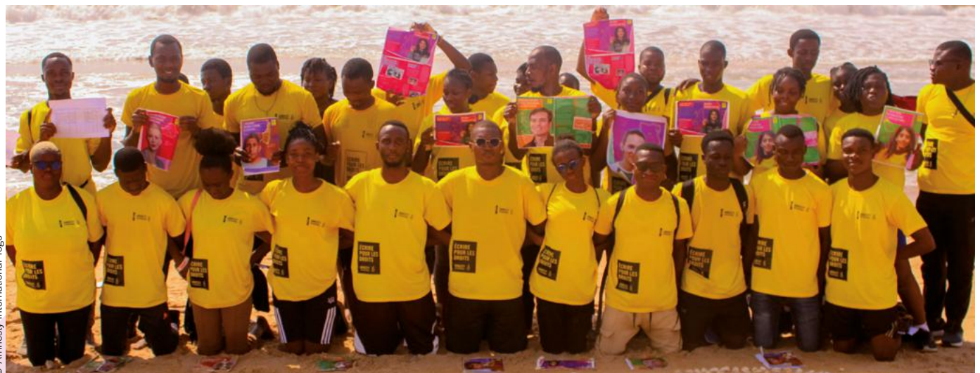
Amnesty activists in Togo during Write for Rights 2024.

human beings. Human rights have become part of international law: since the adoption of the UDHR, numerous other binding laws and agreements have been drawn up on the basis of its principles. These laws and agreements provide the basis for organizations like Amnesty International to demand that governments end the abuses experienced by the individuals featured in our Write for Rights campaign.