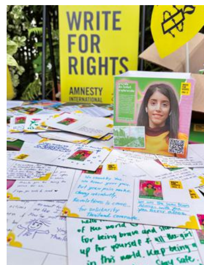
Petitions and postcards in support of Manahel Al-Otaibi during Write for Rights 2024.

ENGAGE emotionally and develop values and personal commitment.