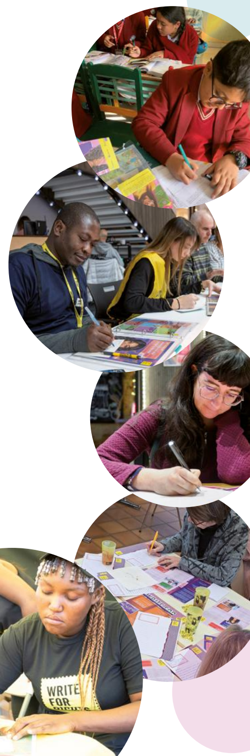
Clockwise from top: Amnesty activists in Nepal, Canada, Bulgaria, Luxembourg, Zimbabwe, Poland and Taiwan take part in Write for Rights 2024.

Learn more about other activities in the Write for Rights campaign at amnesty.org/en/get-involved/write-for-rights/