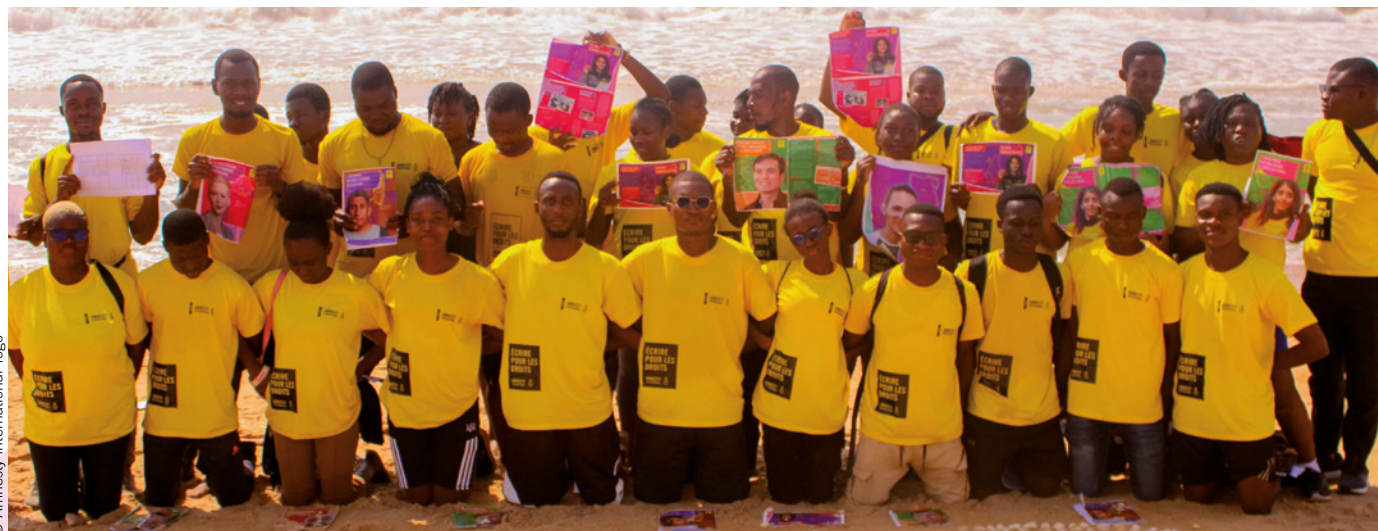
Amnesty activists in Togo during Write for Rights 2024.

human beings. Human rights have become part of international law: since the adoption of the UDHR, numerous other binding laws and agreements have been drawn up on the basis of its principles. These laws and agreements provide the basis for organizations like Amnesty International to demand that governments end the abuses experienced by the individuals featured in our Write for Rights campaign.