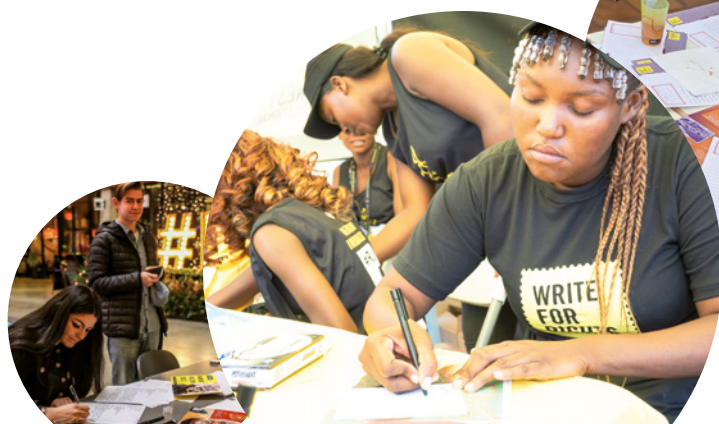
Clockwise from top: Amnesty activists in Nepal, Canada, Bulgaria, Luxembourg, Zimbabwe, Poland and Taiwan take part in Write for Rights 2024.