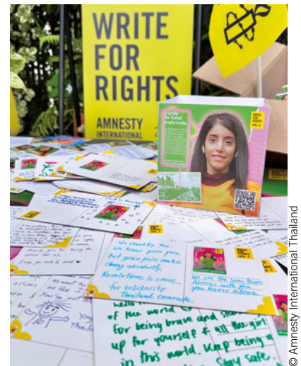
Petitions and postcards in support of Manahel Al-Otaibi during Write for Rights 2024.

ENGAGE emotionally and develop values and personal commitment.